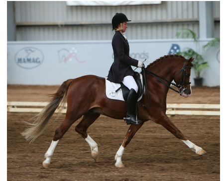
Rahane Caleb – Stallion at Stud

Large variety of fantastic horse and ponies, a small selection displayed below. For more information, visit their website - http://www.freewebs.com/carouselct/ or contact Lisel Dingley on 0428 623 723. (All prices include GST)